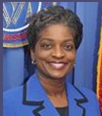
Mignon Clyburn Commissioner Federal Communications Commissioner

FLORENCE, SC (WBTW) -New technology at McLeod Health in Florence will let you get a medical