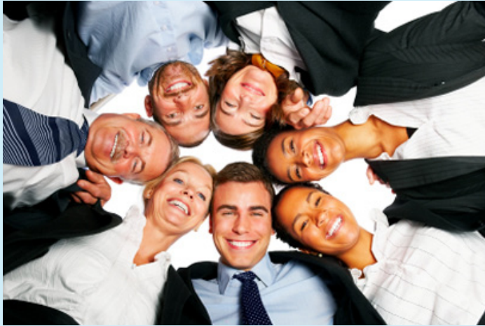
Collaboration, Networking, Leadership Development, and Education

Today the membership is approximately 60 network organizations across the nation and growing. NCHN is a dynamic, progressive, and nationally