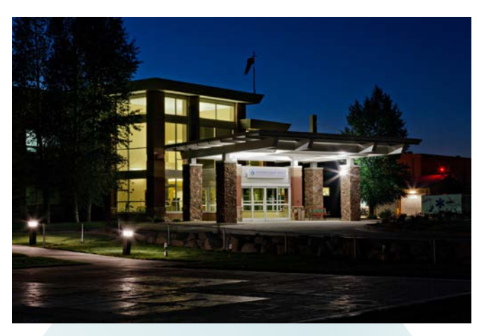
Gunnison Valley Health