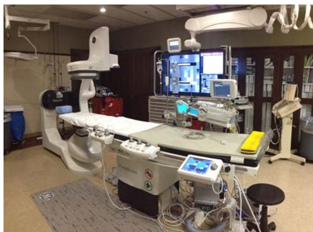
Above is the new GE 730 Cath Lab System recently installed at EIRMC.

EIRMC is a regional leader for many cardiology services, including cardiac catheterization (including transradial), chronic coronary occlusion, cardiac implants, Peripheral Valve Disease, and atrial septal defect (ASD) closures.