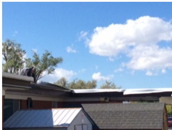
Construction on the roof began September 2, 2014 and is scheduled to be finished before winter.

We look forward to the fulfillment of our current projects and to what future projects are in store for us out here in our Lost Rivers Valley.