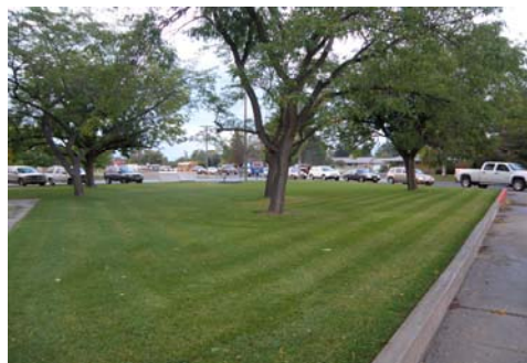
Above: Cars line up at Minidoka Memorial Hospital to get their grab bag.

We at THC would like to extend a huge thank you to everyone who helped plan and participate in this years event.