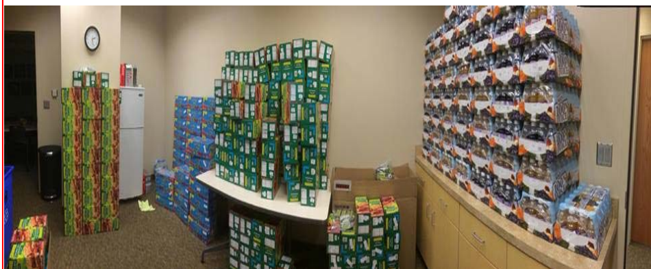
To the Left: Brake for Breakfast supplies overwhelm the office at THC.